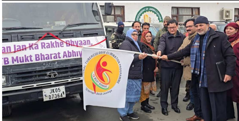
THE KASHMIR TALK BUREAU BARAMULLA:

Public Representatives, District Admin and Healthcare Experts unite in commitment to a TB-Free B'la