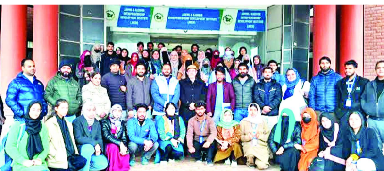
THE KASHMIR TALK BUREAU PULWAMA:

Students interact with star entrepreneurs, gain real time exposure