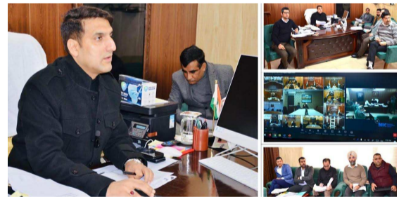
THE KASHMIR TALK BUREAU KISHTWAR:

Discusses formulation of MGNREGA Annual Action Plan 2025-26, land acquisition for Panchayat Ghars