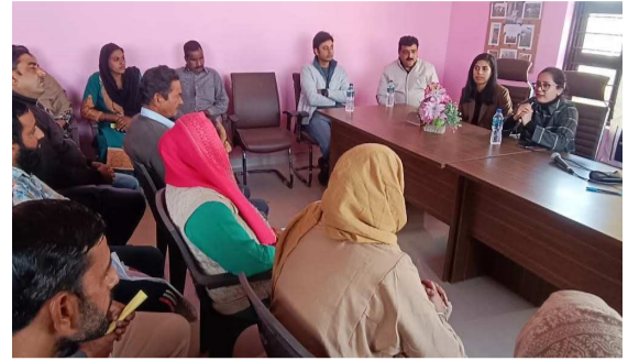
THE KASHMIR TALK BUREAU SAMBA:

An innovative inter-departmental awareness camp was successfully conducted at Panchayat Chajjwal, Block Samba, aimed at promoting self-empowerment and sustainable livelihoods among local residents.