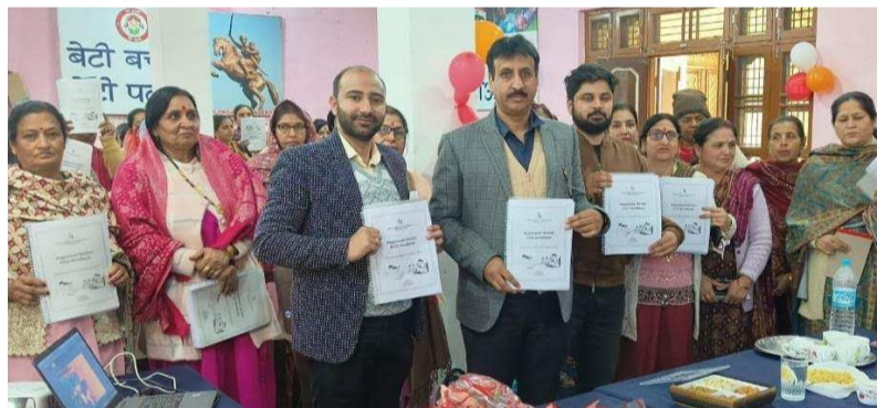
THE KASHMIR TALK BUREAU RAJOURI: