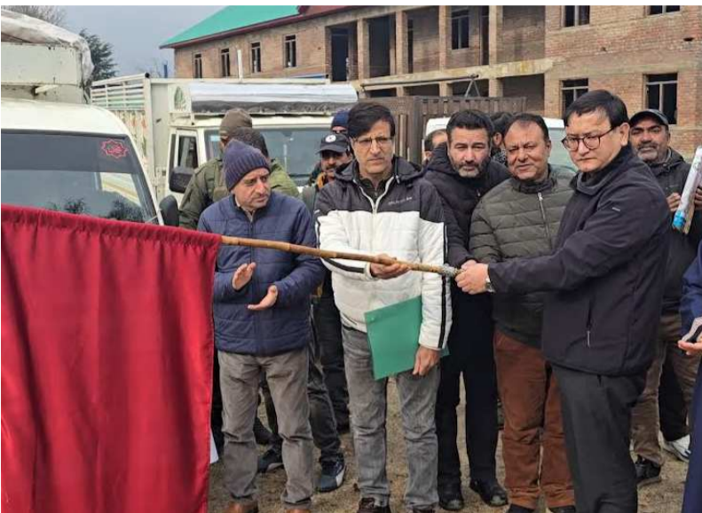
THE KASHMIR TALK BUREAU BARAMULLA:

The School Education Department Baramulla, under the Pradhan Mantri Poshan Shakti Nirman Scheme, launched an initiative to